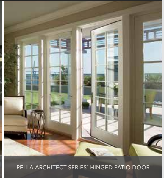
PELLA ARCHITECT SERIES® HINGED PATIO DOOR