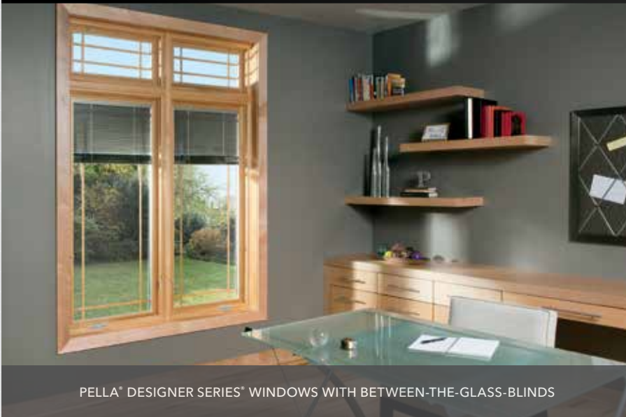
PELLA® DESIGNER SERIES® WINDOWS WITH BETWEEN-THE-GLASS-BLINDS

Pella Commercial puts a priority on customer service – delivering a prompt replacement experience with minimal disruption to your life and your neighbors’ lives.