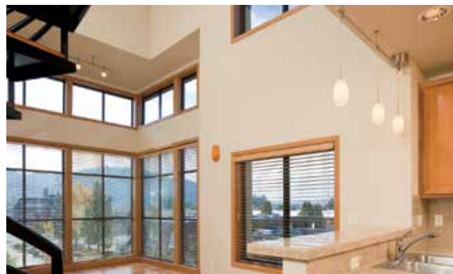
PELLA® IMPERVIA® FIBERGLASS WINDOWS